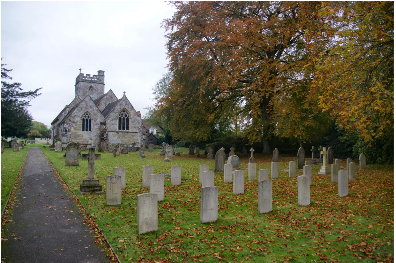
St George's Churchyard, Fovant – War Graves at front & rear